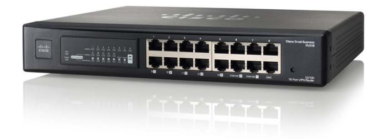
Figure 1. Cisco RV016 Multi-WAN VPN Router

To further safeguard your network and data, the Cisco RV016 includes business-class security features and optional cloud-based web filtering. Configuration is a snap, using an intuitive, browser-based device manager and setup wizards.