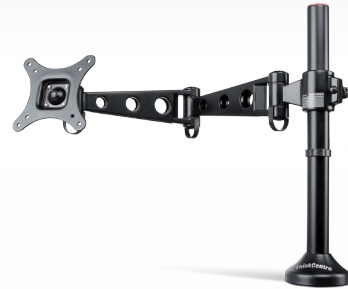
ThinkCentre® Extend Arm