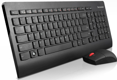
Lenovo® Ultraslim Wireless Keyboard and Mouse Combo