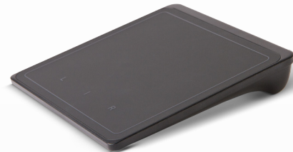
Lenovo® Wireless Touchpad