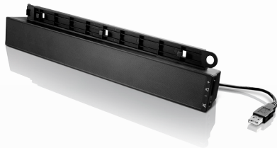
Lenovo® USB Soundbar