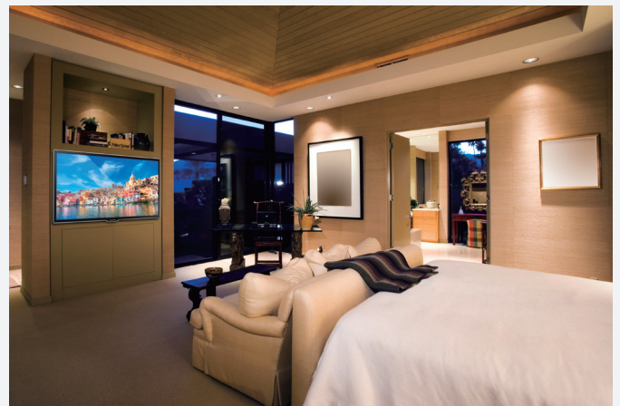
Figure 1. Samsung HC770 Series displays elevate the in-room entertainment experience while enhancing the guest room's ambiance

High-quality displays in guest rooms can contribute to an enjoyable hotel stay. With the elegant design of Samsung HC770 Series ultra-slim displays, hoteliers can elevate guests' viewing experience. Light and unobtrusive, the displays feature a narrow bezel, providing more viewing area. The displays boast an ultra-slim form factor that provides hotel guests with a richer viewing experience and a more elegant in-room atmosphere.