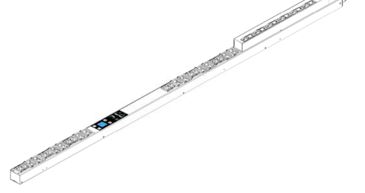
Monitored PDU, Mid Height Models (D9N47A/D9N48A shown)