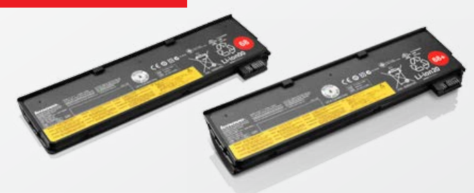
OC52861 ThinkPad Battery 68 (3-cell) OC52862 ThinkPad Battery 68+ (6-cell)