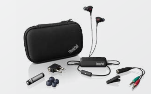
OB47313 ThinkPad Noise Cancelling Earbuds