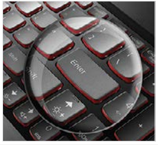
BACKLIT KEYBOARD Backlit keyboard, now with Windows 8 function keys, for a better user experience