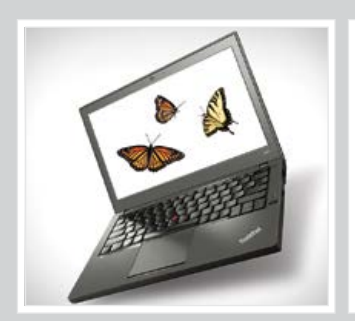
THE ULTIMATE ULTRAPORTABLE 20.3 mm (0.79") thick and weighing under 1.36 kg