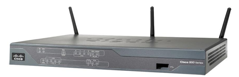
Figure 1. Cisco 881 Integrated Services Router with Integrated 802.11n Access Point

Tables 1 and 2 list the routers that currently make up the Cisco 880 data, voice, and SRST series, respectively.