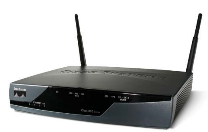
Figure 1. Cisco 871 Integrated Services Router

Table 1 lists the routers that currently make up the Cisco 870 Series.