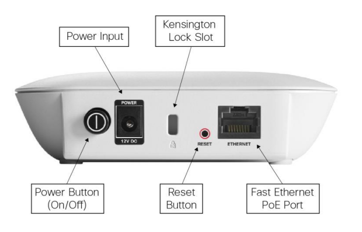
Figure 3. Back Panel of the Cisco WAP121 Wireless-N Access Point with PoE