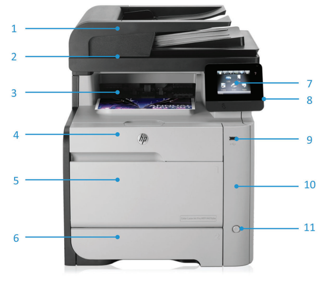
HP Color LaserJet Pro MFP M476dw