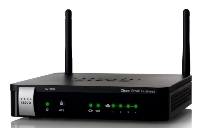
Figure 1 Cisco RV110W Wireless-N VPN Firewall

The Cisco® RV110W Wireless-N VPN Firewall provides simple, affordable, highly secure, business-class connectivity to the Internet for small offices/home offices and remote workers.