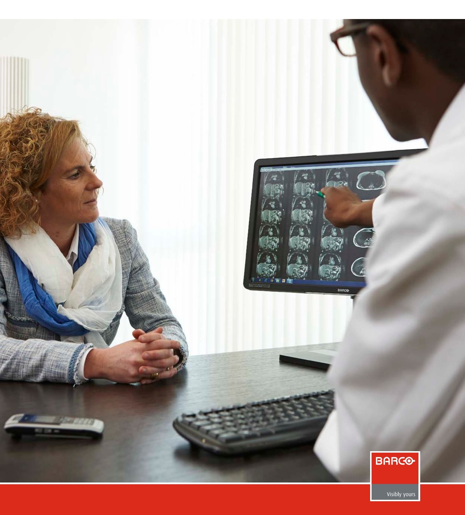
Eonis The precision healthcare specialists need