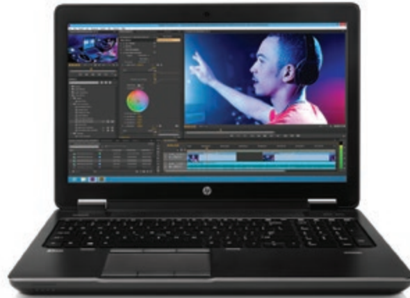
HP ZBook 15 Mobile Workstation

Push your creative limits with a powerful mobile workstation redesigned for productivity on the go.