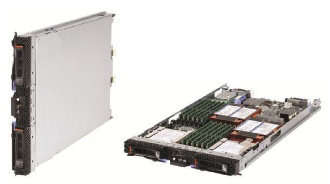
Figure 1. IBM BladeCenter HS23E