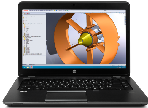
HP ZBook 14 Mobile Workstation

Deliver your best work on the go using the world's first workstation Ultrabook™ 1