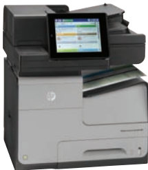
HP Officejet Enterprise Color MFP X585f